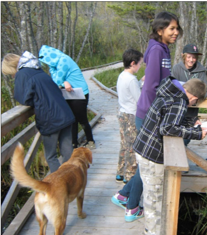
The Gavin Lake boardwalk over the wetlands provides students an opportunity to learn about the importance of riparian areas to the forest ecosystem.

BC's wilderness is a rich learning environment for future foresters and global citizens, and we're very fortunate to have this “environmental service” in our backyard.