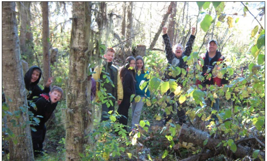
Campers at Gavin Lake experience a one-hour hike with a volunteer forester who teaches species identification, explores the dynamics of the ecosystem, and even highlights logging practices.

Gavin Lake provides programs year round and is supported by a number of forestry sector donors, the Cariboo Woodlot Education Society (Woodlot Licence 552) being the largest, providing $20,000 in funding in 2013. Forest education is a core part of its mandate, so it's an