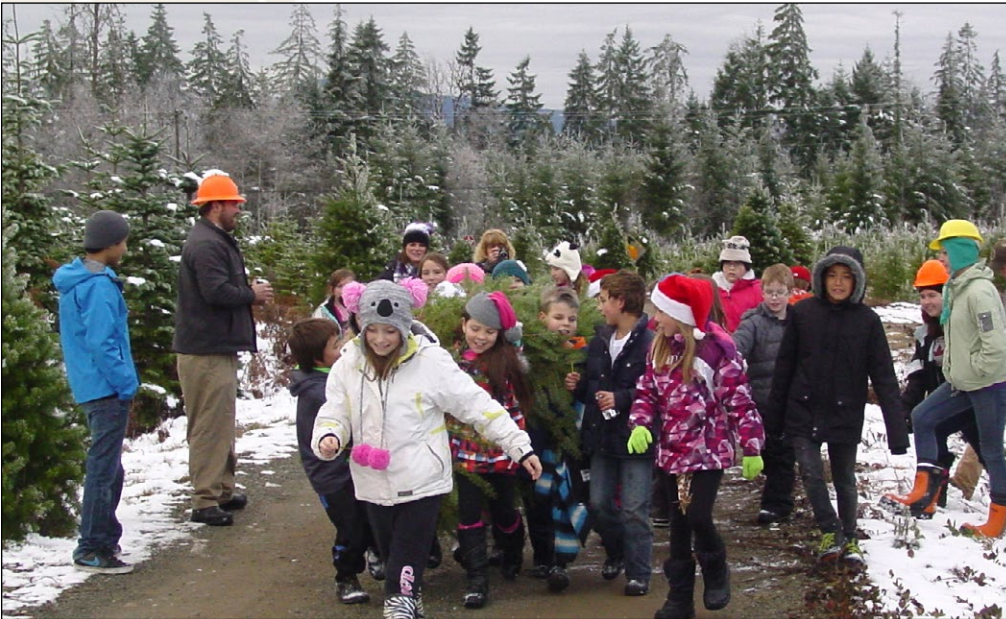
Grade 3 and 4 students from Gill Elementary take a field tour through a Christmas tree farm which included choosing their own Christmas tree.

The FBCWA provided financial support to the program when it first started in 2009. It has proven to be successful and well received by SD 70 and the Minister of Education. It is in its sixth year of operation and is jointly funded by the forest industry and SD70.