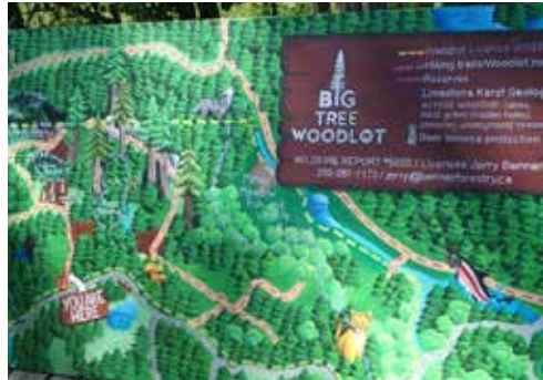
A sign portraying roads as trails for hiking and biking and areas where you'll find resident wildlife, old-growth trees and mushrooms for foraging.