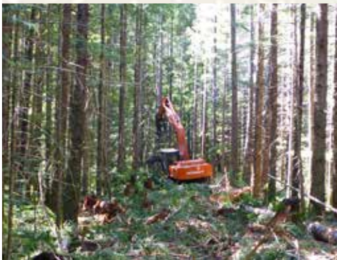
An excavator falling and processing wood in a thinning corridor to reduce "wind throw" on WL #1641 near Campbell River