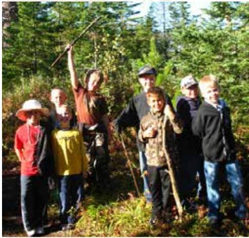
A 'Walk in the Woods", Willow River Demonstration Forest WL #272 near Prince George