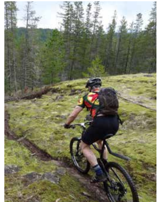
Mountain biking, WL #1611, Quadra Island

Woodlots are the backyards of countless communities...a place where we work, play and learn.