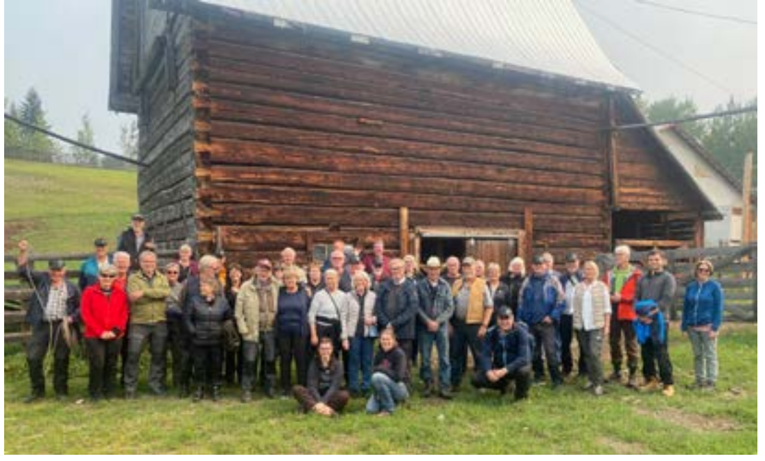
Swedish Tour Group

see Finnish Ponsse equipment operating on a cutblock heavily impacted by mountain pine beetle. They visited milling facilities, farms, hatcheries and always forests as they made their way to Prince Rupert, before hopping the ferry and heading through the inside passage down to Vancouver Island. There they made their way through a variety of stops to see Coastal Forestry and those massive coastal trees. They headed to Vancouver at the end of their trip to fly away home.